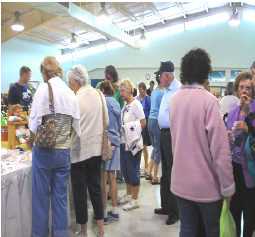
Eager customers and buyers are seen at a previous Spring Fling